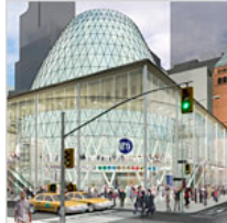
Proposal Would Move Arts Center to Transit Hub