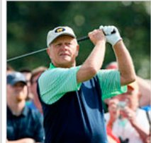
As Woods Chases History, History Appears