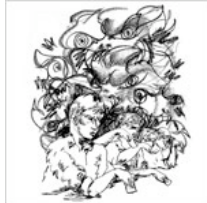
Op-Ed: Nepal's Perilous Ascent