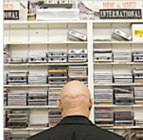
Princeton's Offline Haven for Music Shoppers